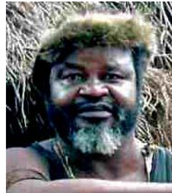
PS7: Indigenous Peoples