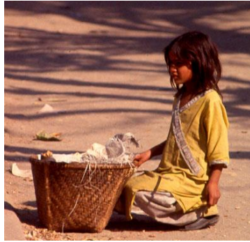
PS2: Labor and Working Conditions