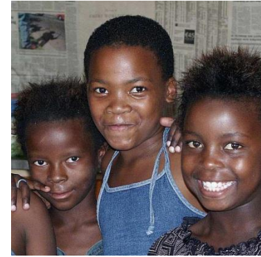
PS4: Community Health, Safety and Security