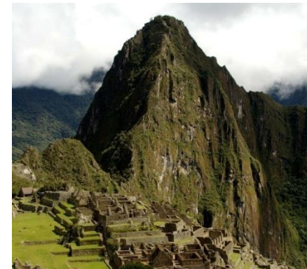
PS8: Cultural Heritage