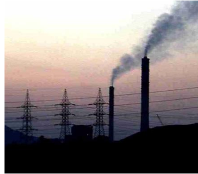
PS3: Pollution Prevention and Abatement