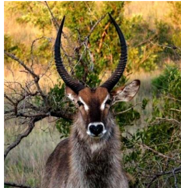
PS6: Biodiversity Conservation and Sustainable Natural Resources Management