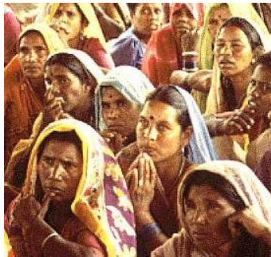
PS5: Land Acquisition and Involuntary Resettlement