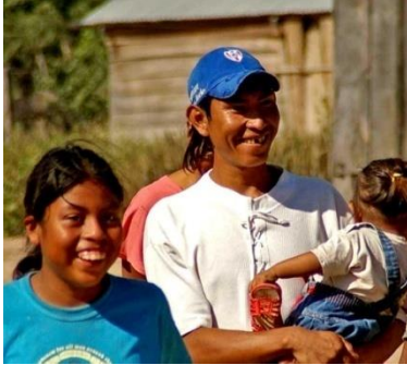
PS1: Social and Environmental Assessment and Management Systems